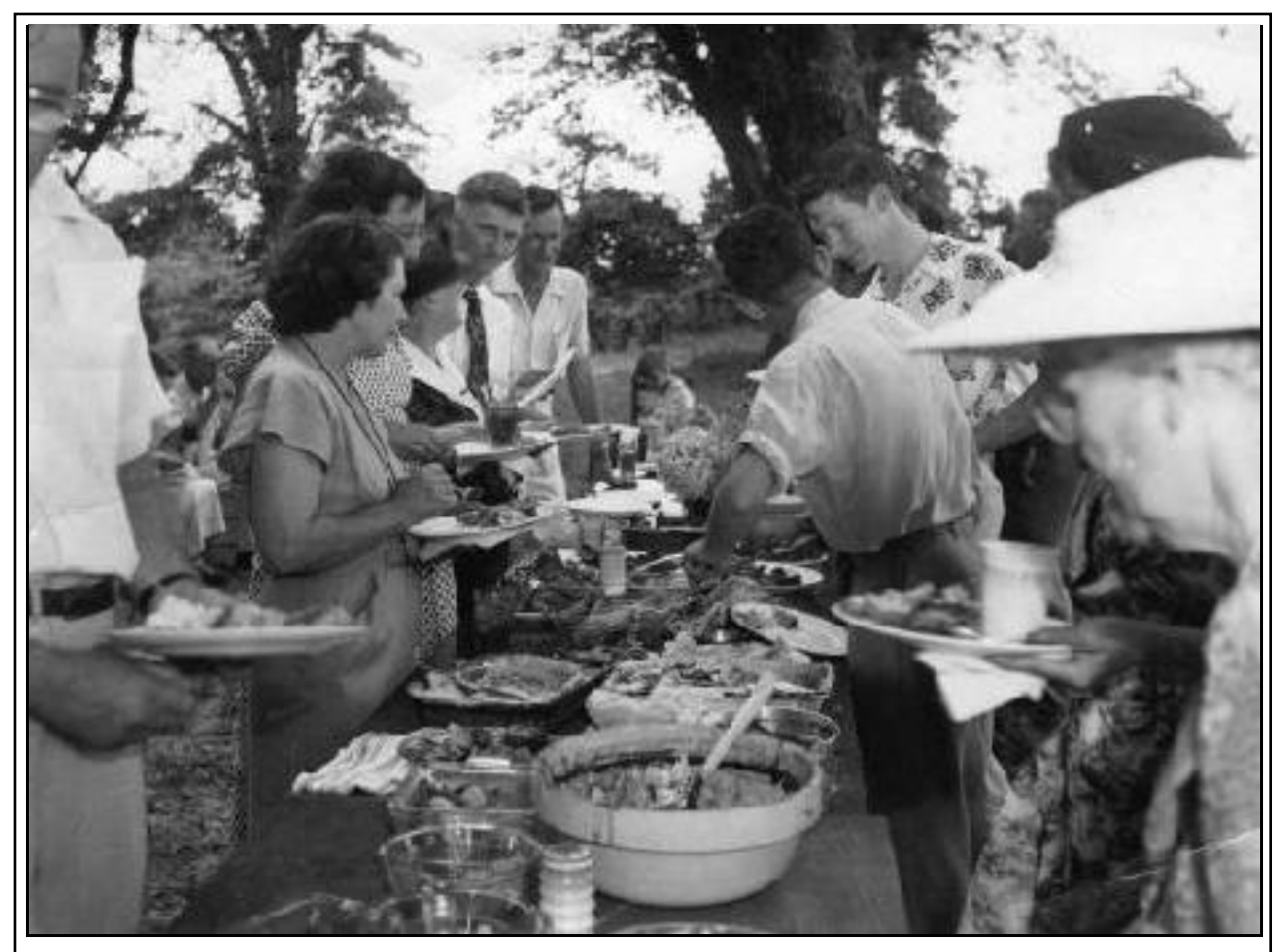
Dinner on the Grounds—1950s

On Sunday following the 11:00 Holy Eucharist, everyone will gather in the grove for Dinner on the Grounds . Also taking place will be the traditional Country Market . Plan to purchase a meal ticket and invite friends to join us for the annual fundraising event.